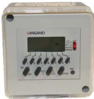
Dimensions & Electrical Connections